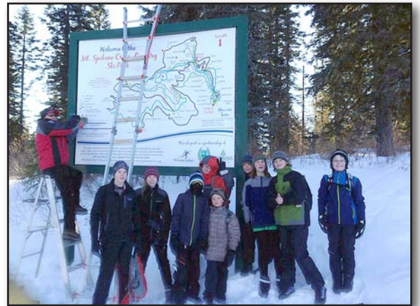
Youth Rangers helped put up trail signage, learned back-country skills, took skate ski lessons, and more.