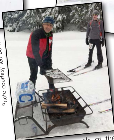
Warming energy gels at the Junction 8 aid station