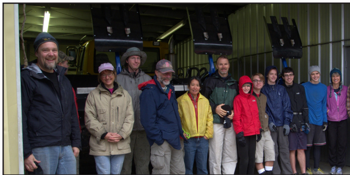
Spokane Nordic board members, family and friends get out of the rain for a photo during trail clearing on Mt. Spokane last week-end.