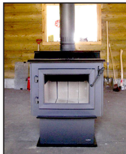
The new stove should keep Nova Hut a warmer destination this season.

This fall, a few volunteers brought a proposal to Spokane Nordic to enclose the ski waxing/preparation area beside the Selkirk Lodge. Spokane Nordic is funding addition of treated plywood below the benches and polycarbonate sheets above the benches, and dedicated skiers are putting it together.