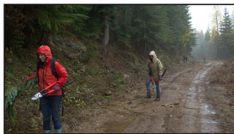
Trail clearing in the rain.

One of the amazing things about Mt. Spokane Cross-Country Ski Park is that even on a busy Saturday afternoon, you can ski out past Nova Hut and see only a few other pleasant faces. If you're