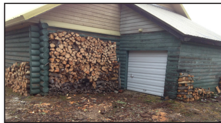
Firewood for Selkirk Lodge and Nova Hut came from trail maintenance and widening by Spokane Nordic members.

We will also be adding an on-mountain camera that will give real-time visuals of snow conditions at the Selkirk Lodge trailhead.